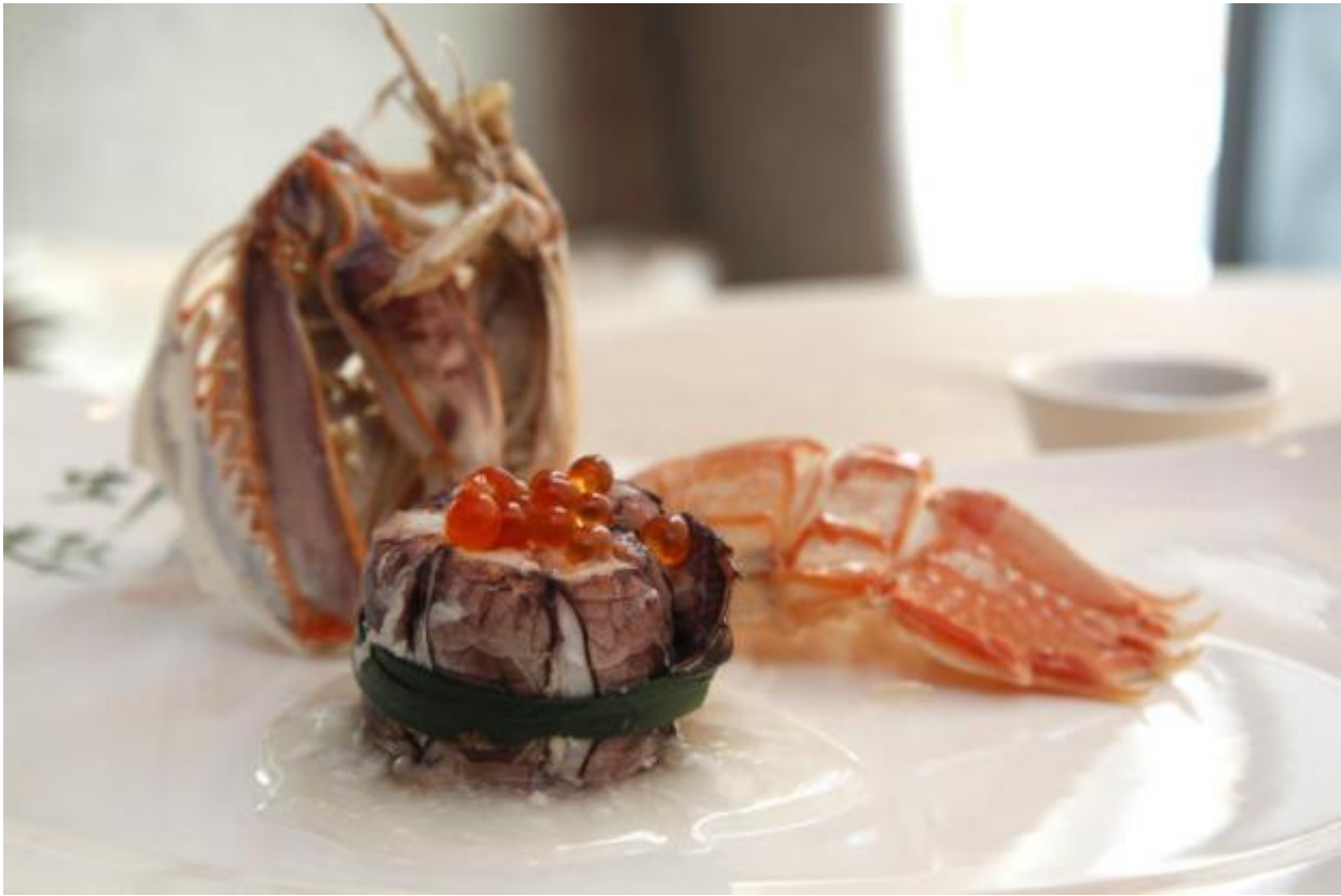
Poached Australian mantis prawn with egg white sauce.