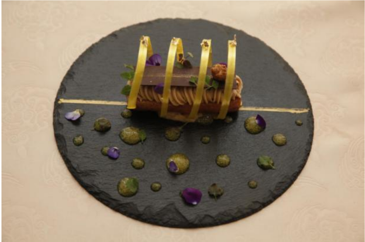
The chocolate praline chrysanthemum éclair.