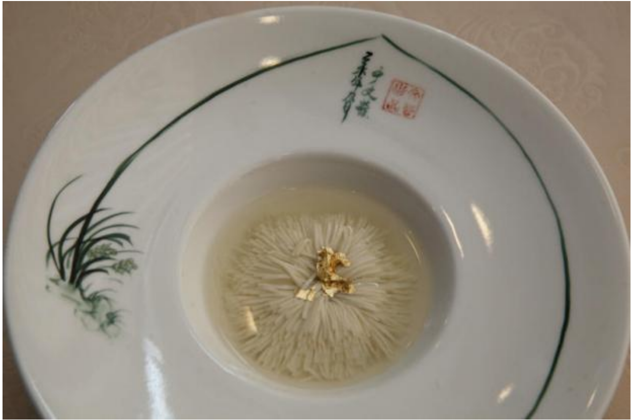
Chrysanthemum tofu dessert on a hand-painted plate.