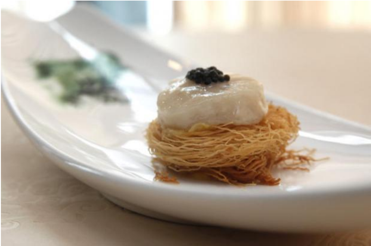
Seared scallop with mango sauce and caviar on golden nest.